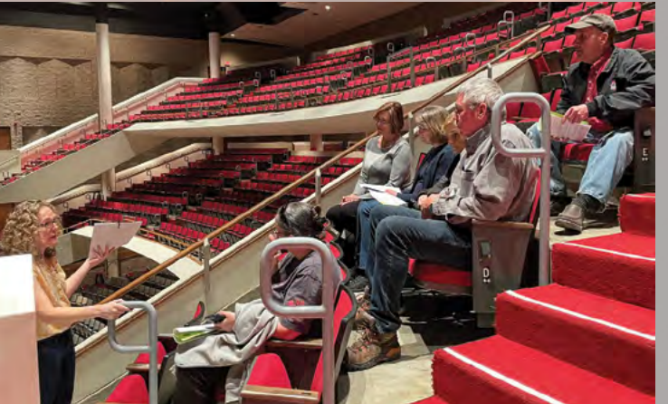
New volunteer training