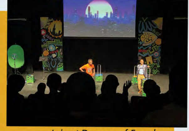
Jabari Dreams of Freedom