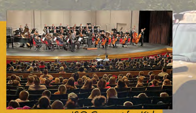
ISO Concert for Kids