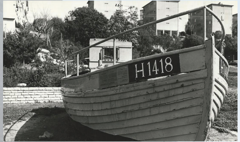
Hundreds of people were smuggled across the water to Sweden, often in Danish fishing boats like this one.

Many families were very brave as they hid Jewish friends in their houses, like the Johansens did with Ellen, until they could help them escape Denmark. Members of the Resistance successfully smuggled over 7,000 of Denmark’s nearly 8,000 Jews out of the country into Sweden on fishing boats, thereby protecting them during the rest of the War until they could return home.